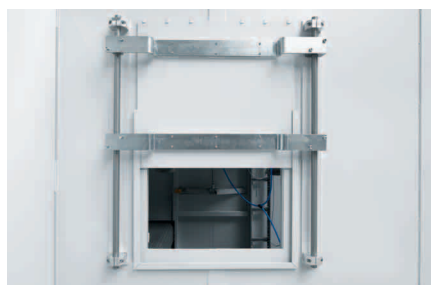
Lightning-fast trap door: The 90 kg partition closes in 0.6 seconds and is decelerated at the last moment by a cushioning block.

Turnkey automation solutions for customers from the automotive, medical/pharmaceutical, food and plastics industries. Area of business: Handling and assembly technology