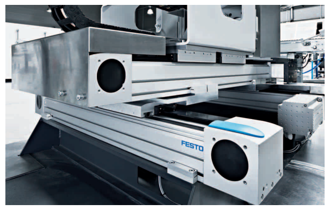
Seamless transfer: A chain conveyor transports the alloy wheel directly to the open gripper, which secures it for the X-ray process using four support wheels (top).