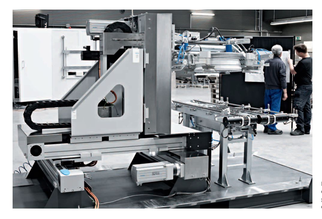
Ready-to-use precision: Erhardt + Abt only had to connect the handling gantry with the gripper unit using defined interfaces.