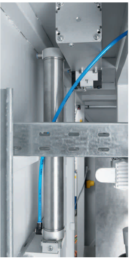
Landing on the "air cushion": Two flange-mounted air chambers ensure that the partition closes quickly yet gently.